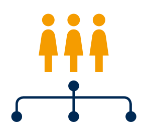
We have three new female directors